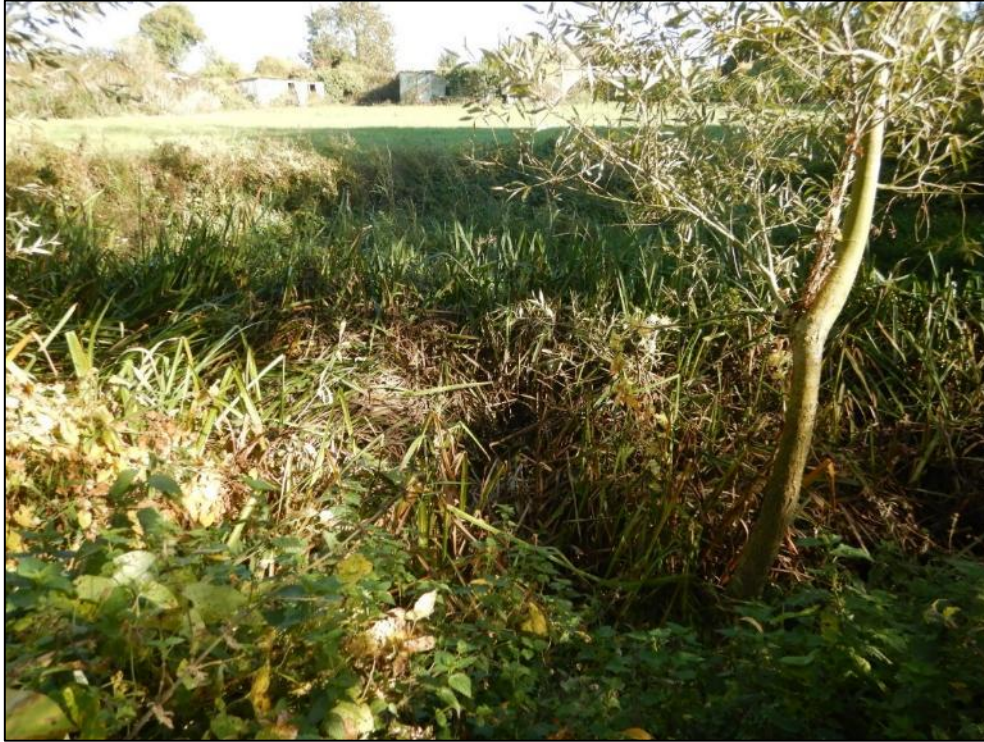
Pic 4 – A stand of bur reed almost engulfed the channel where the river once flowed swiftly.

been lowered. It is then very difficult for a river to recover a natural morphology without significant introduction of coarse sediment; this may not occur naturally, particularly if there is limited supply from predominantly fine sediment (alluvial) banks.