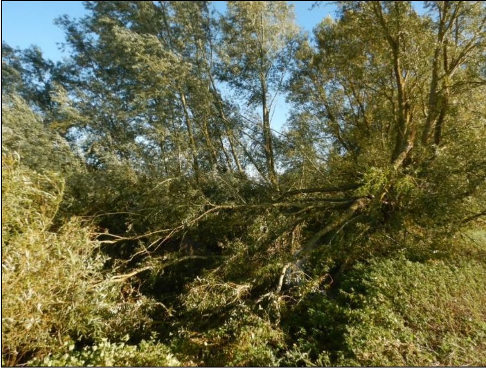
Pic 24 – Two or possibly more pollard willows had been left to grow tall with much canopy weight, unsurprisingly significant collapsed has occurred.

A massive collapsed pollard willow had been left unmanaged (52.143879, 0.066434 pics 25 & 26). Interestingly, with its limbs touching the ground they had re-rooted. This anchoring increased the tree's stability and its ability to uptake water and nutrients. This tree highlights the need to assess the reach's willows in winter when they can be properly viewed, and the need to produce a plan of willow tree management (which may include 'do nothing') and new planting to include further species.