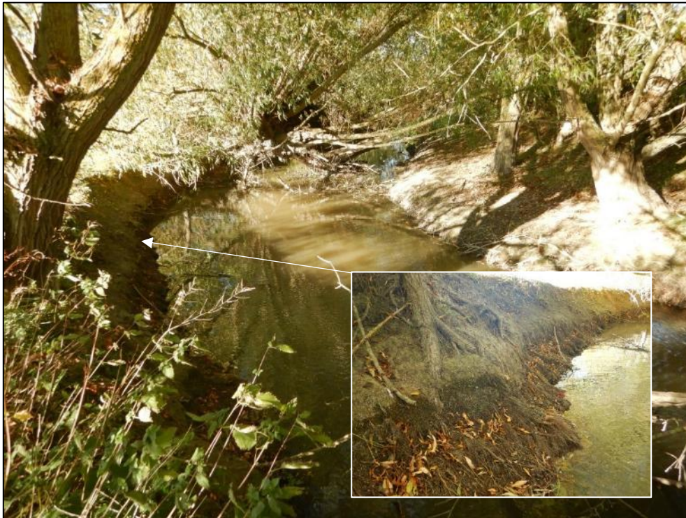
Pic 19 – Willow roots hold the bank firm.

has had its gravel bed almost completely removed and the alluvial banks erode only to add further fine sediment to the system which is massively overburdened.