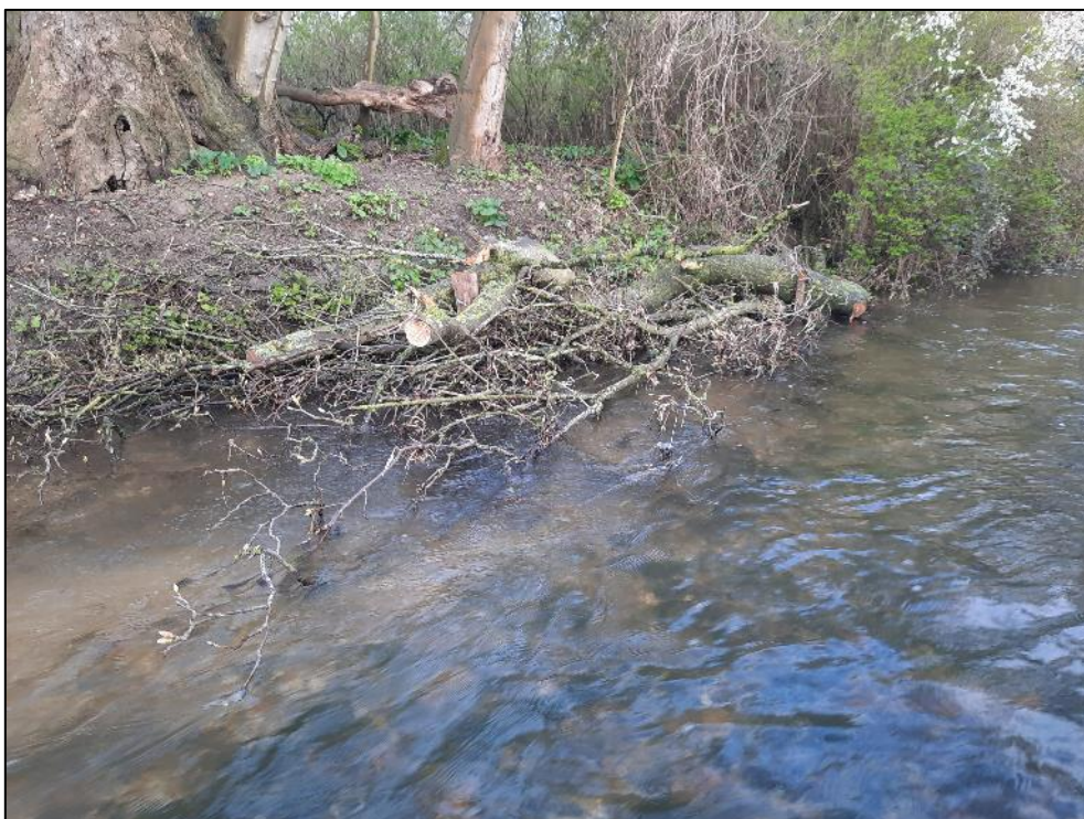
Pic 30 – Tethered and pinned wood in river margins can deflect flow creating small areas of scour, whilst the bulk of the woody material slows the flow and encourages fine sediment to be held. The complex cover also provides excellent protection for trout.

With permissions from landowners and the EA it may be possible for the WTT to train the Friends on habitat enhancement measures such as installing woody features, brush ledges and flow deflectors.