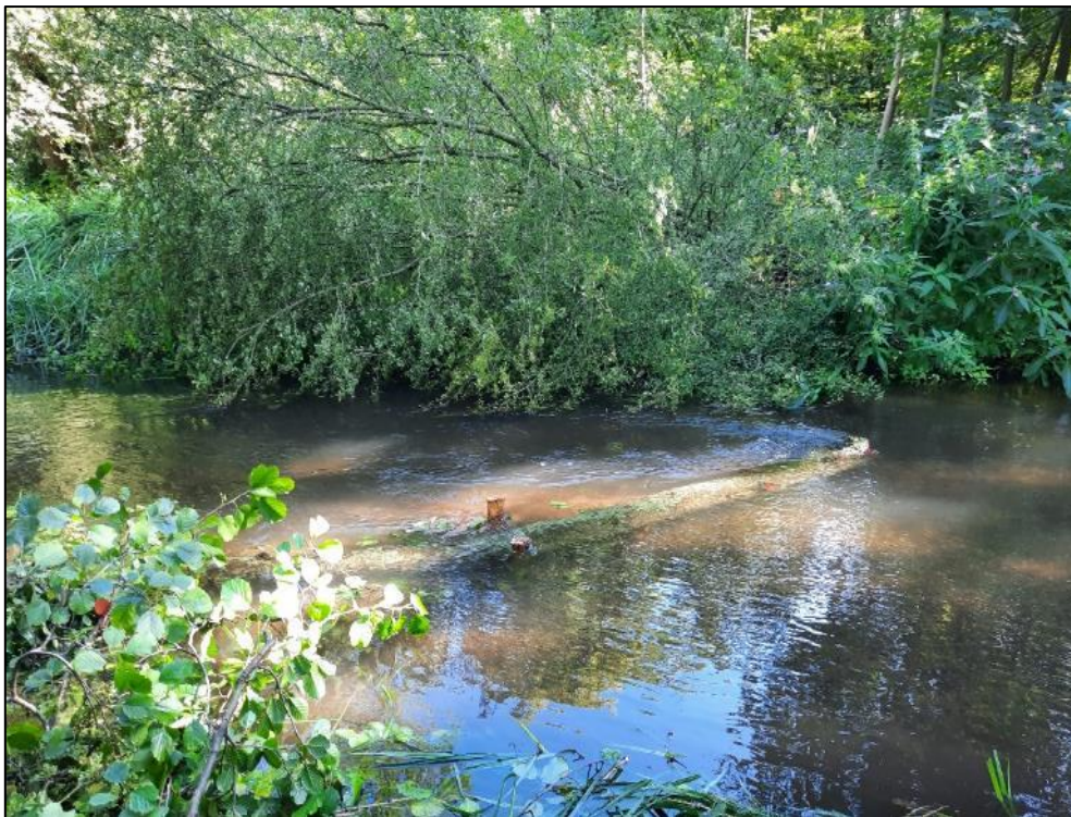
Pic 32 - A flow deflector used to focus flow and scour beneath a tree hinge-cut into the margins, providing excellent cover.