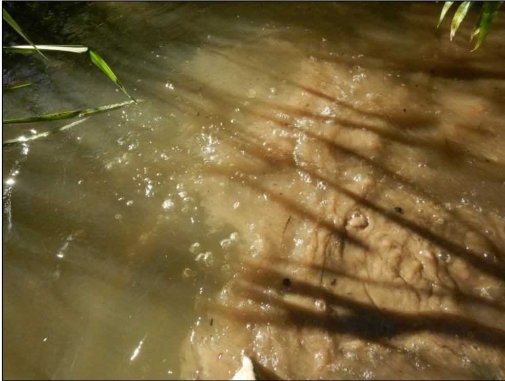
Pic 14 - Kicking the bed released a large volume of foul-smelling gas.

local anglers stating that certain reaches appear to contain few larger fish anymore (larger fish have higher oxygen demands, as do species such as brown trout). After the long 'sand bar' the depth returned to what was expected, ~1.2m.