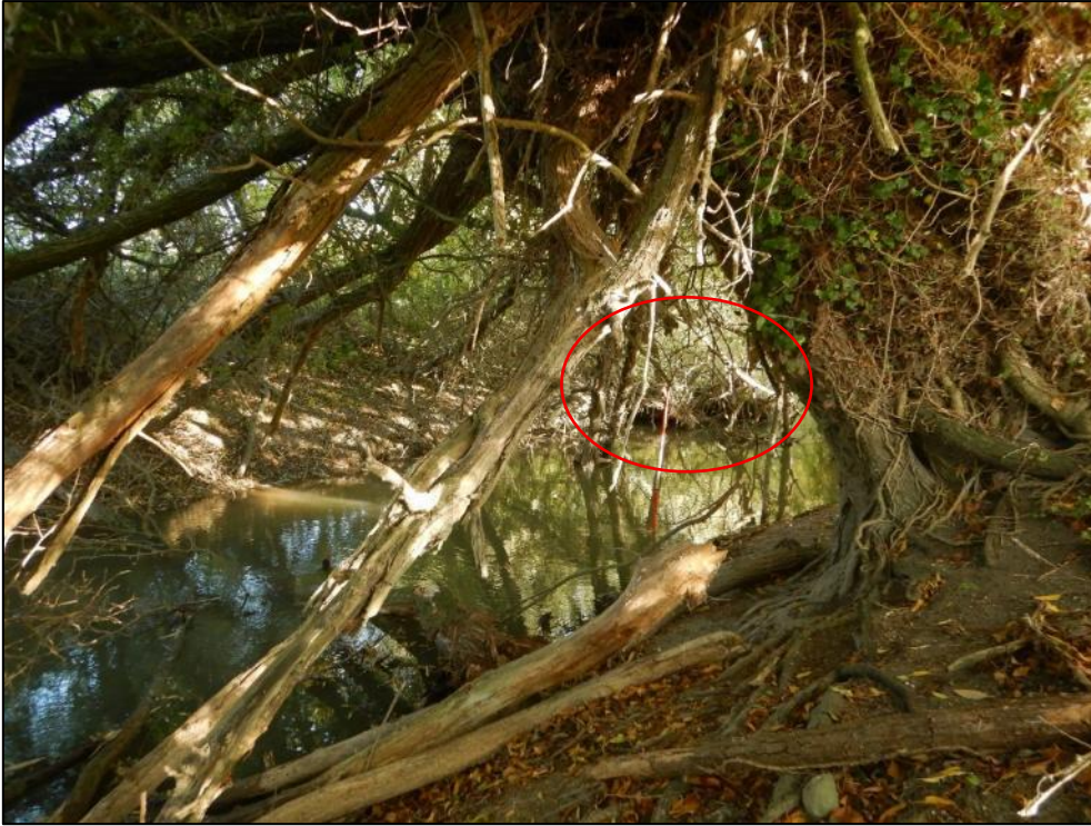
Pic 25 – A massive collapsed willow now supported by its branches. The branches have collected material (red ellipse) which provides flow deflection and cover to animals.