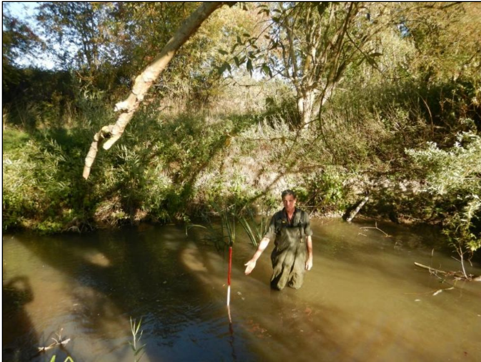
Pic 13 – The author supported on ~0.8m of firm fine sediment.

The deposition of very large volumes of fine sediment, which is not subject to annual scouring and flushing, demonstrates the extent of bed raising that the river requires to bring about restoration of riffles and glides that would have been present many decades ago. The river has been dredged, and then subject to bed incision, and now it is simply filling with sediment to a point where scour prevents further deposition and fine sediment remains mobilised. Restoration of the river's bedform using large volumes of mixed grade gravel and stone should be a medium-term aspiration for Friends of the River Rhee.