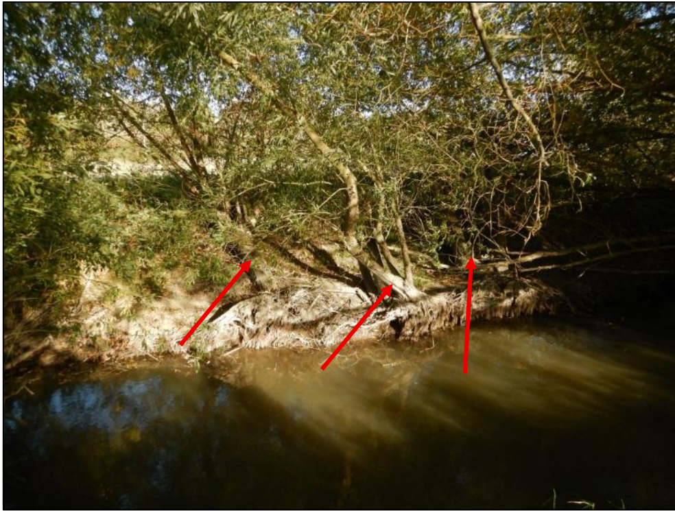
Pic 23 – These willows (red arrows) had grown at the toe of bank, only to blow over resulting in channel widened once again.

Considering willow management again, it was interesting to observe recent canopy fall (pic 24). Where “medium aged” pollard willows had been left they had multiple branches of the same diameter (and one would assume strength) and of great length. The wind had caught the branches to bring down a large number all at once. The oldest and largest pollard willows did not support a large number of long branches, instead they tended to have around five, with some having been lost as the tree has aged (beneficially lightening its load). Contrastingly, willows that had been left to grow naturally retained their strong central stem from which high branches grew of various diameters. This made them less susceptible to total collapse and didn’t cast dense shade like top-heavy mature pollards. Pollarding of willow trees is typical of the Cambridge area but if it cannot be sustained then its purpose and ultimate value should be reconsidered.