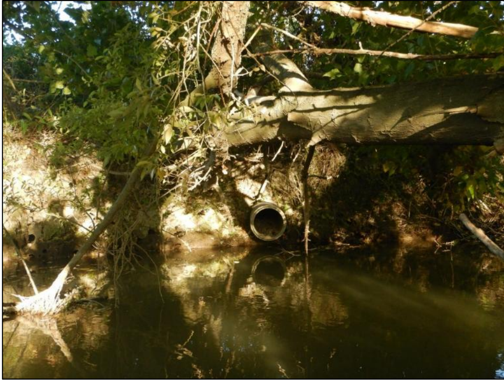
Pic 21 – A pipe, possibly leading to an artificial otter holt.

Any remaining gravel is likely to be heavily silted. Importantly, with respect to the spawning requirements of brown trout, clean and well-sorted gravel is needed, generally in the range 10mm-40mm, which will remain stable and undisturbed for up to 100 days before young trout (the fry) emerge in early spring (illustration 1). It is doubtful that trout could spawn in this reach of river, they will rely on tributary streams.