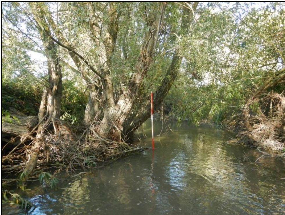
Pic 12 - Flow deflection by the willow has maintained pool depth by flushing through fine sediment.

Due to the permanence of a large willow which grew low from the left bank (52.140834, 0.069730), flow was deflected to the centre of the channel resulting in depth creation and maintenance (pic 12). The depth was \sim 0.8\text{m} , and in combination with the cover provided by the tree, is likely to harbour adult fish, especially trout and chub. The high, but strong, canopy of a willow that had not been too frequently pollarded, retained shade and high cover over the water. Shade over rivers is becoming increasingly important as hotter summer temperatures are experienced. A further benefit of trees over rivers is the terrestrial invertebrates that occupy them, which may ultimately fall to the river below to become prey for fish.