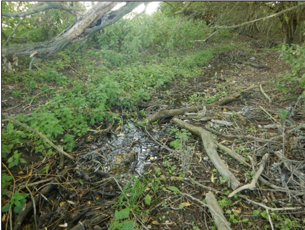
Pic 27 – A flush entering from the side of Clock Holt.

evidence of it ever having the energy to downcut its channel or scour away the excess of fallen wood.