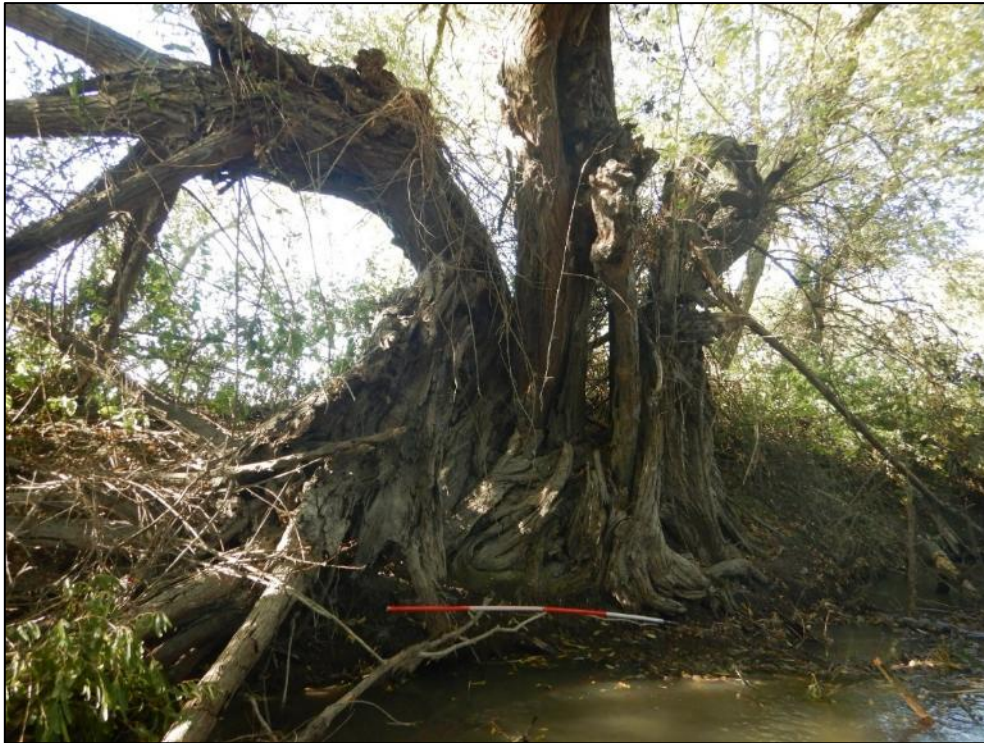
Pic 10 - Another very large veteran pollard willow.

washout as high flows return or a branch causes new flow deflection. Permanence of river features leads to better fine sediment sorting and transport along the river, with the evolution of a greater variety of ecologically important habitats.