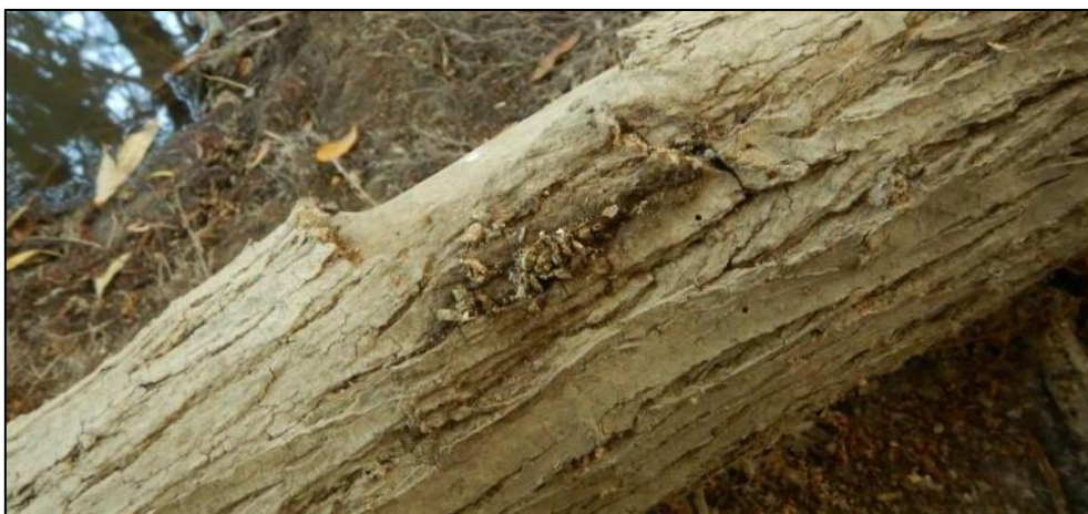
Pic 20 - Otter spraint on a fallen willow branch.

Amongst cover afforded by the willows and their collapsing branches, otter spraints were found. Although old and dried, it was possible to see fragments of crayfish carapace and occasional fish bones (pic 20). Otters have been present in the Rhee catchment since the early 1990s. A possible artificial holt, with a pipe entrance, was observed at 52.145146, 0.066302 (pic 21). The now defunct Cambridge Greenbelt Project embarked on a programme of holt building to aid the species' recovery.