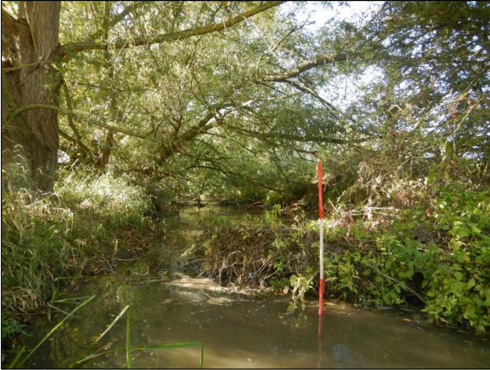
Pic 17 – The channel was dominated by fallen material once again (52.141157, 0.069642).