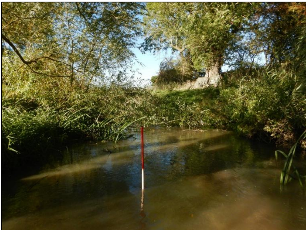
Pic 15 – Once the fine sediment deposition reduced, depth was established once again.