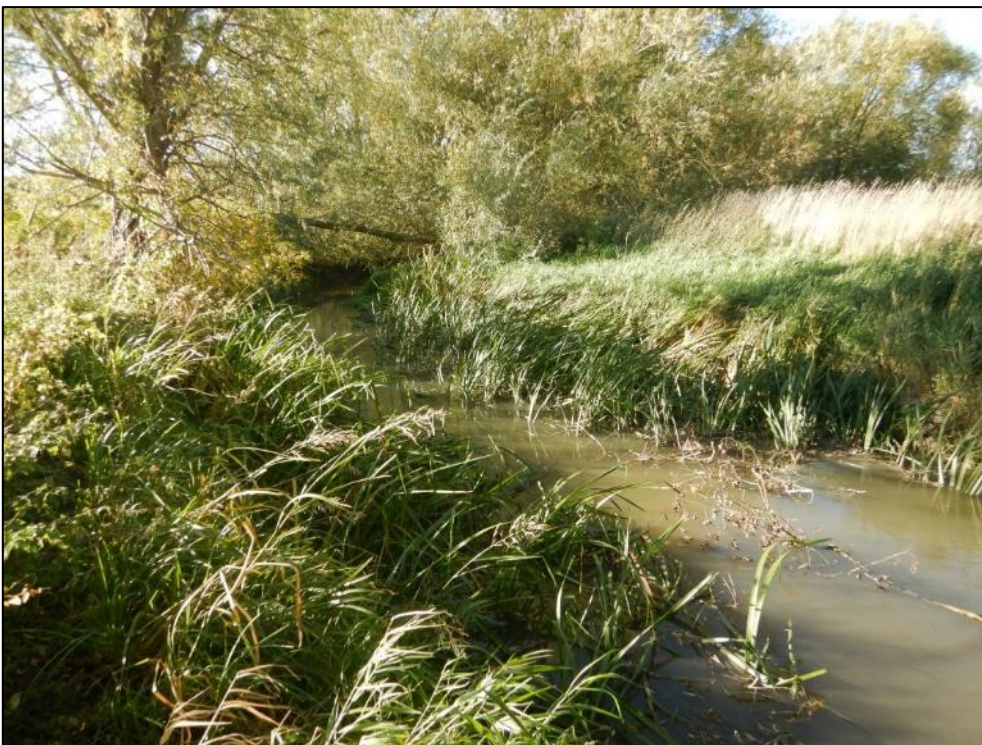
Pic 18 – Bur reed growing as marginal plants suggesting mid-channel scouring of fine sediment.

Turning another meander, willow tree roots held the bank firm (52.141535, 0.068675 pic 19). Willows can effectively lock a river in its current state, if that state is one of poor-quality habitat, then that will be maintained. In a naturally diverse and active river, fresh supplies of gravel would be transported downstream from eroding gravel beds and banks, but the Rhee