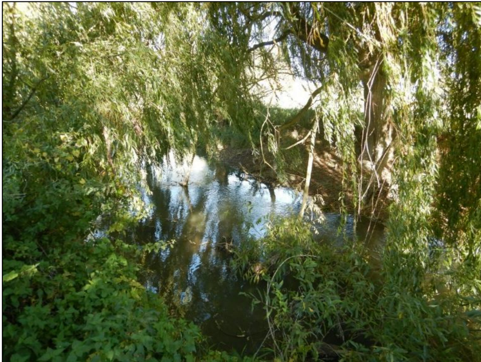
Pic 1 – The visited started where the river was overhung by a weeping willow from the right bank downstream of the Harston Road bridge. Several of the weeping willow limbs had set roots into the water.

The visit commenced immediately downstream of the Harston Road bridge with the left bank used for access. River width was estimated at 5-6m with a depth known to range from \sim 0.4\text{m} to \sim 1\text{m} . A ranging pole was used to show depths in pictures.