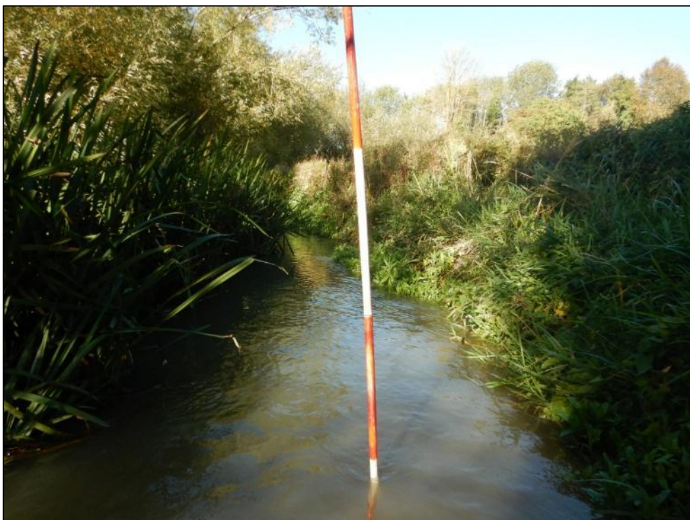
Pic 5 – Where light reached the right bank vegetation gave it strength and narrowed the channel.