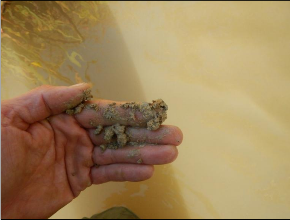
Pic 22 - Gault clay lifted from the bed of the river.

This report has highlighted examples of willow trees stabilising riverbanks and sediment deposits forming new river forms, but they cannot be relied upon to bring about restoration in the short to medium term. Where willows colonise bed sediments their roots spread out first into the softest material, this means that roots are rarely put down into the hard bed. Trees may grow for several years until their canopies catch the wind, then entire stands of trees can be uprooted, lifting the rootbase from the riverbed and margins resulting in an overly wide channel once again (52.142397, 0.068192 pic 23). The supply of mixed grade substrates is required to bring permanent river restoration in combination with tree establishment.