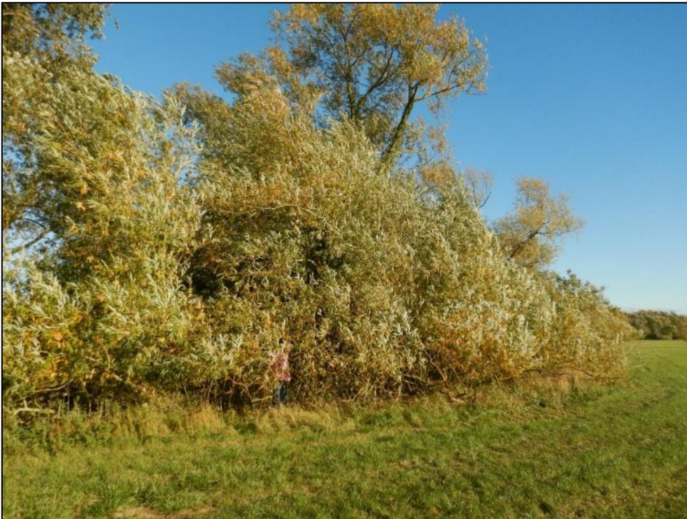
Pic 26 – The same tree as pic 25, note how wide it has spread with branches now rooted. This tree should be left unmanaged and not be re-pollarded.

As Clock Holt was approached a small flush was observed (52.145173, 0.066214 pic 27). It was encouraging that it was still flowing in the drought. However, it was not a strong flow and is unlikely to provide a spawning area for fish. Much of its flow was seeping through the ground, with little