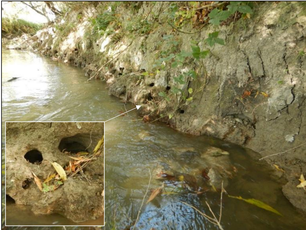
Pic 7 - Crayfish galleries resulting in block failure of the bank. Crayfish burrows shown inset.

Walking on the riverbed released a high volume of fine sediment (as expected) but investigation by hand revealed a high volume of organic matter, most of which appeared to have originated from (willow) trees (small twigs, catkins and leaves, pic 8). Encouragingly, there were large numbers of freshwater shrimp ( Gammarus sp.) breaking down the matter. The input of naturally occurring organic matter to a river is normally to be welcomed, but in this instance, one must wonder just how much lays at the bottom of the river, and whether it is being cleansed by a through flow of water, or whether it is simply accumulating year on year (if entering anaerobic conditions). Note the gas bubbles in the picture. Further inspection of the bed substrate beneath the organic matter revealed fine sediment mainly of sand, grit and small (~5mm) gravel (all particles of a size that the river can transport by its flow).