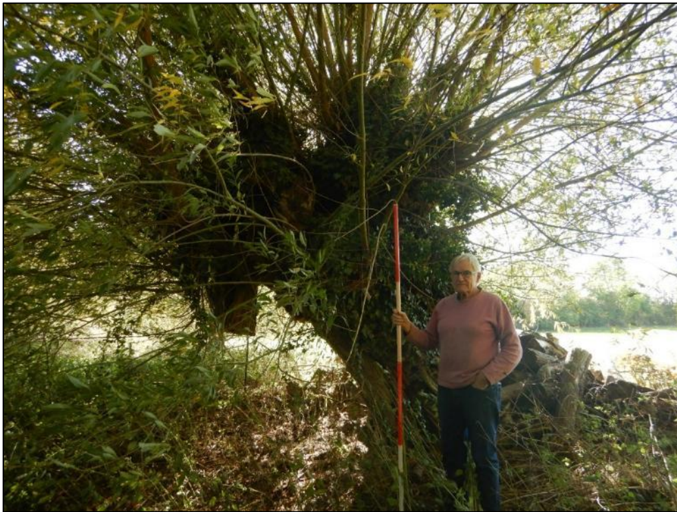
Pic 3 - Veteran pollard willow.

light reaching the river and its banks, as well as sustaining the age of the tree before it collapses. There are also benefits to allowing trees to grow naturally (even if formerly pollarded): important fallen wood enters the channel, the river is kept cool by the shade of canopy for longer, and a better diversity of structure and age can evolve when pollarding complements existing standard trees. The challenge for the Rhee is to establish a tree-management regime that protects the very best of the veteran willow trees and creates diversity amongst the remaining stock. It is also important to consider diversifying the species present and not to rely solely on willows as the main riverside tree. Only a few other species of tree were observed during the visit: common alder, white poplar and walnut. Understory species of elder and hawthorn were occasional.