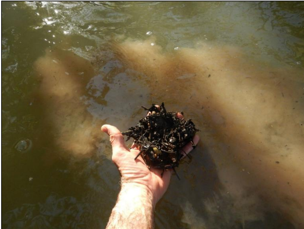
Pic 8 – A very large volume of organic material had accumulated on the riverbed.

Whilst the diversity and abundance of aquatic plants is reduced from that known 20 years back, it was pleasing to observe willow moss (pic 9) growing attached to willow roots suspended in the river's surface layer. Without trailing branches this plant would not find a niche. The plant favours cool water with a medium to fast pace. Its trailing stems and leaves provide a substrate for fish such as perch and roach to spawn upon, and for aquatic invertebrates to shelter amongst. The former gravel run below the Harston Road bridge was once dominated by water crowfoot (a chalk river indicator species) and arrowhead grew abundantly by late summer together with unbranched bur reed. High water turbidity, and the action of crayfish is now considered to adversely affect aquatic plant growth.