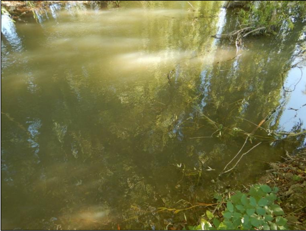
Pic 2 – Turbidity was extremely high, with visibility into the water little more than 30cm.

Moving downstream along the left bank, a slight levee of past dredging spoil was present. The dredging would have removed large volumes of ecologically valuable gravel that would have provided habitat diversity, fish spawning areas, and sustained important aquatic invertebrate communities, which in turn would feed fish. As a consequence of the dredging, the channel has become incised and is not as diverse as it would have once been. The levee now partially disconnects the river from its floodplain, and prevents flood water from draining back to the river.