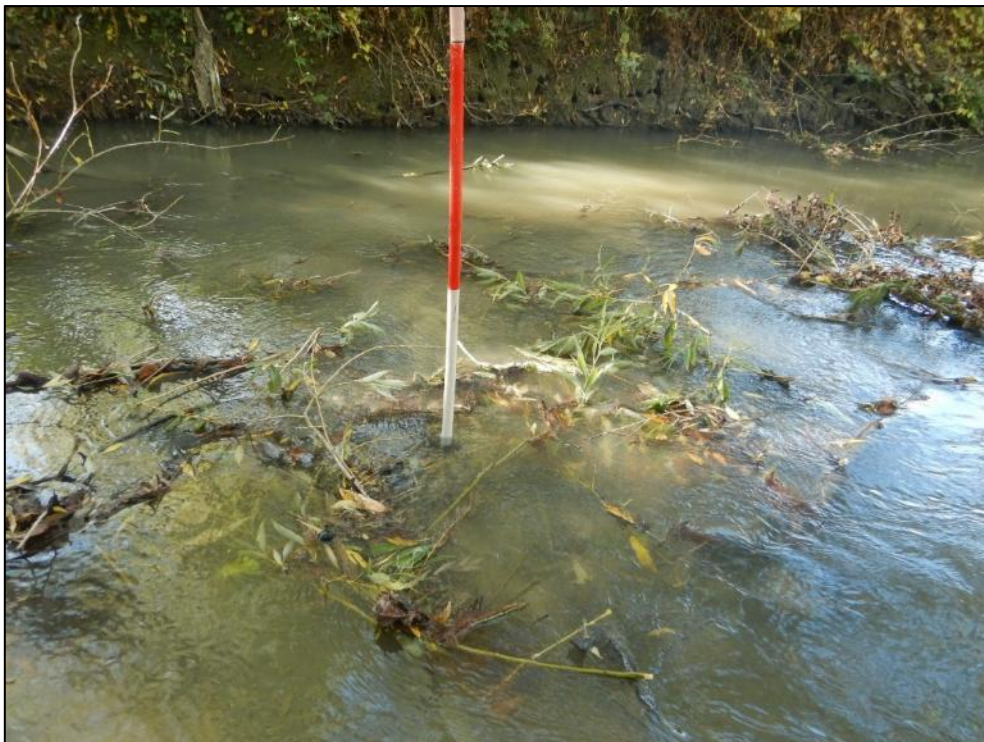
Pic 11 - A mid-channel bar of fine sediment.