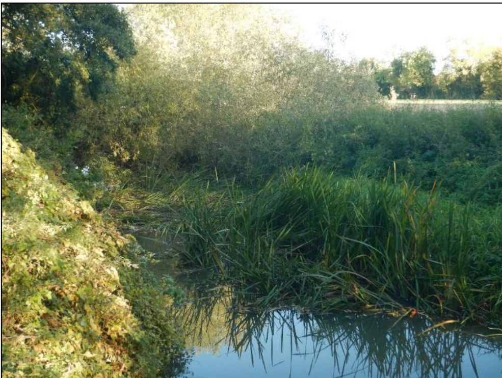
Pic 29 – The river immediately downstream of Clock Holt (end of visit).