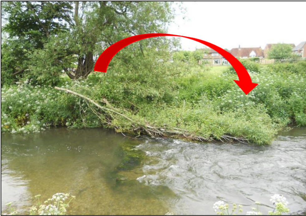
Pic 31 - Tree hinging, a simple and effective technique for increasing cover and flow deflection.