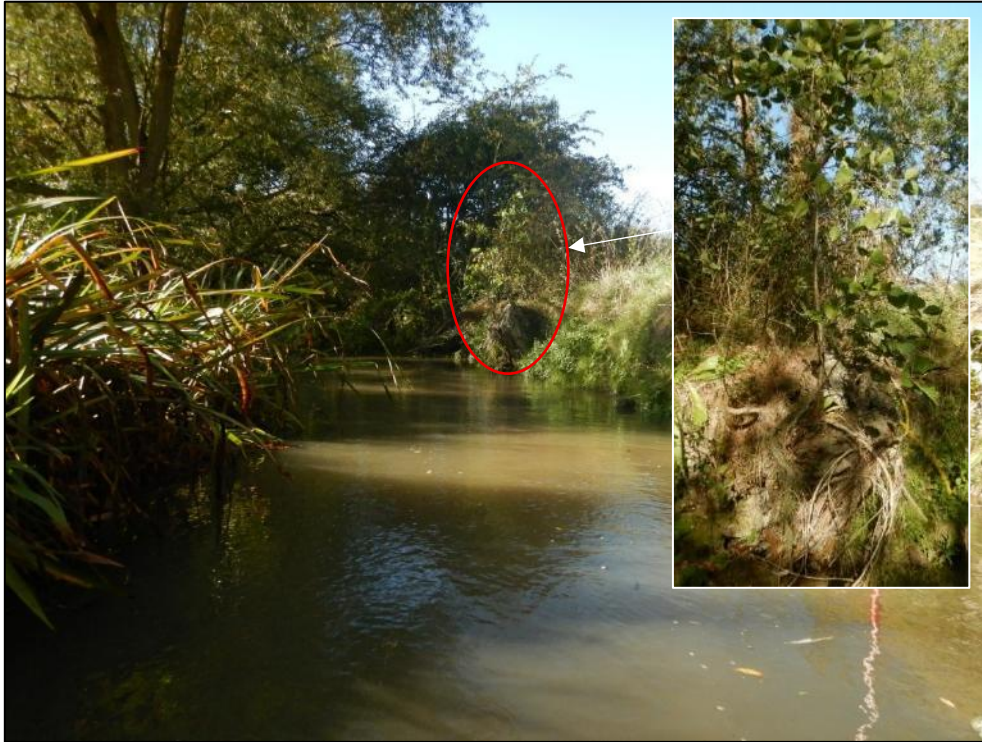
Pic 16 – A common alder was observed. Alder roots are excellent for stabilising banks and should be included in future planting schemes.

Following the meander, the bed had been scoured, with fine sediment entrained to the lee of the left bank where a marginal stand of bur reed grew as one would expect (pic 16). A common alder sapling grew from a tree stump cut from over the river, had this been the river's only alder?