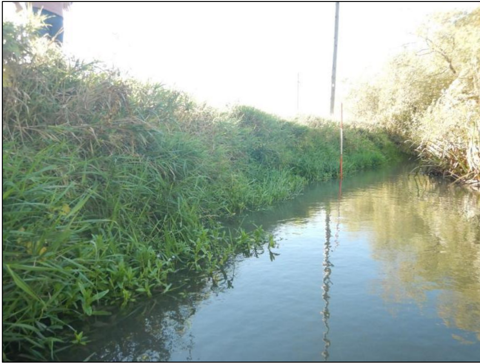
Pic 21 - Where light reached the bank vegetation was established.

Further investigation of the riverbed where it shallowed once again (to \sim 0.4\text{m} ) revealed little coarse substrate. Instead, a sample of gault clay was lifted (52.141508, 0.068675 pic 22). The Rhee is categorised as a chalk river, but with its gravel bed removed, erosion has now exposed gault clay. Fine clay particles are easily mobilised and held in suspension. In the last \sim 20 years the signal crayfish population has exploded in the Barrington to Harston reach; the constant activity of possibly millions of crayfish is constantly mobilising even more clay particles than would naturally occur. It is the author's view that the action of invasive crayfish (undertaking a form of bioturbation), in combination with past dredging, has created conditions for high turbidity to prevail. This phenomenon is currently being investigated by different parties including the Cam Catchment Partnership ( Sediment and Turbidity – Cam Catchment Partnership ) and the Cam Valley Forum ( 22049-final-CVF-Turbidity-Summary-2025-03-31-.pdf ). It is quite possible that a number of pressures are compounding to cause turbidity in different ways. Decomposing organic matter can also contribute to water turbidity.