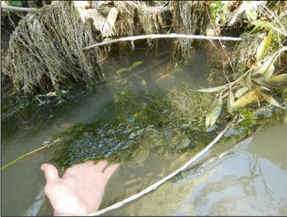
Pic 9 - Willow moss growing attached to trailing willow limbs.

Another very large veteran pollard willow was observed at 52.140564, 0.069554 (pic 10). Although in state of decline, its roots still held the bank strong, and its branches provided a source of important large woody material (LWM) to the river. The occurrence of fallen branches, together with the organic matter that they collect, may look unsightly to some but the presence of LWM is of great importance within rivers. LWM leads to an increase in the surface area on to which a biofilm (algae, bacteria and other microbes) can grow. Where LWM presents no flood risk it should be retained as it improves hydraulic roughness within the channel and, as water is forced around and under, it can initiate bed scour. Fallen LWM can also provide cover to fish from predators. Where possible, fallen trees and timber should be secured in river margins to increase habitat and cover.