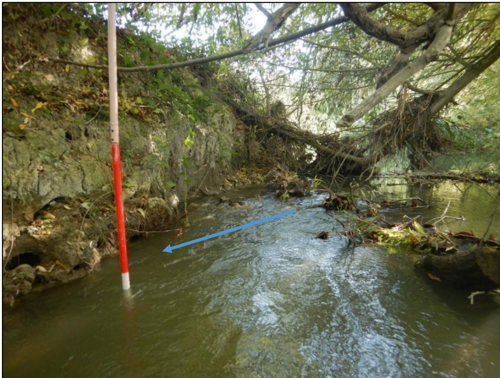
Pic 6 - Flow was being pushed against the weak alluvial bank.

Beneath the extensive willow tree canopies sunlight was reduced and the bank was largely devoid of vegetation. Collapsed willow branches trailed to the water and created random flow pathways. Trout will use this complex cover for shelter and feeding opportunities; with multiple lies created the river may support greater numbers of fish. But with the very high number of fallen branches and numerous flow pathways against the bare and weak alluvial bank (pic 6), block failure was occurring (pic 7) causing large volumes of fine sediment to enter the river. This failure was being exacerbated by extensive galleries of crayfish burrows. Signal crayfish are an invasive non-native species which are recorded as causing a range of problems when they establish in watercourses ID Pacifastacus leniusculus (Signal crayfish) .