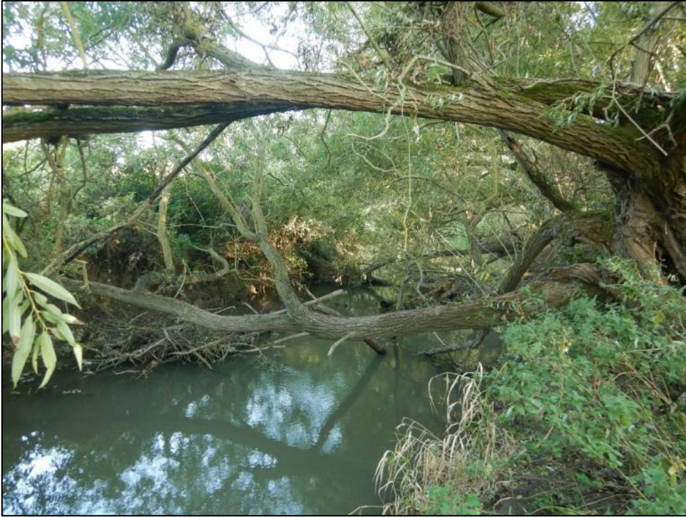
Pic 28 – The view looking upstream from Clock Holt.